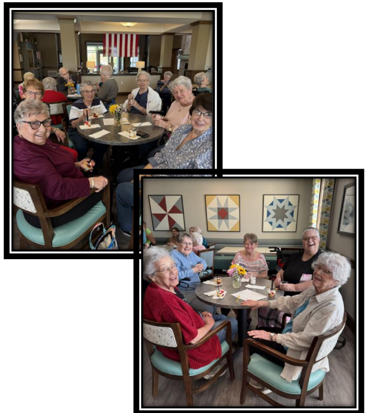
Residents enjoying strawberry trifle & trivia